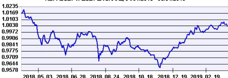
NET ASSET VALUE PER SHARE, 04/01/2018 - 03/31/2019

— Aegon Emerging Europe Bond Fund EUR series