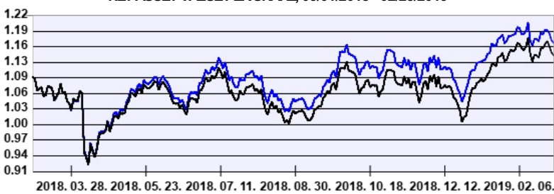
NET ASSET VALUE PER SHARE, 03/01/2018 - 02/28/2019

— Aegon Russia Equity Fund PLN series — Benchmark