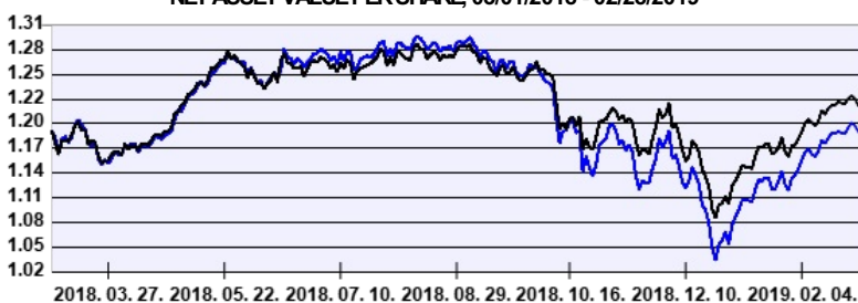
NET ASSET VALUE PER SHARE, 03/01/2018 - 02/28/2019

— Aegon MegaTrend Equity Fund of Funds HUF series — Benchmark