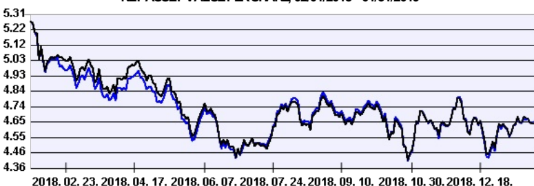
NET ASSET VALUE PER SHARE, 02/01/2018 - 01/31/2019

----- Aegon Central European Equity Fund EUR series ----- Benchmark