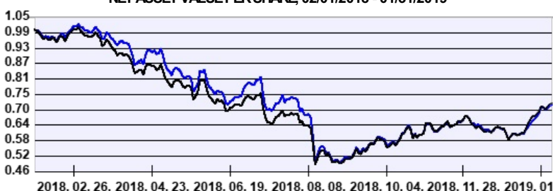
NET ASSET VALUE PER SHARE, 02/01/2018 - 01/31/2019

— Aegon Istanbul Equity Fund PLN series — Benchmark