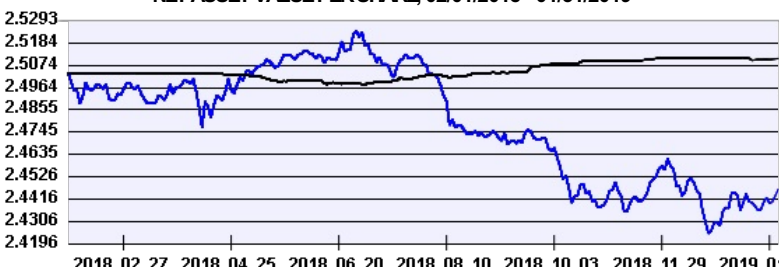
NET ASSET VALUE PER SHARE, 02/01/2018 - 01/31/2019

— Aegon Alfa Total Return Investment Fund PLN series — Benchmark Past performance is no guarantee of future results. This report should not be considered as an offer or investment advisory. The Fund Prospectus contains the detailed conditions of the investment. The distribution costs of the fund purchase can be found at the distributors.