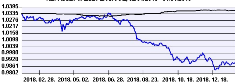
NET ASSET VALUE PER SHARE, 02/01/2018 - 01/31/2019

— Aegon Alfa Total Return Investment Fund EUR series — Benchmark