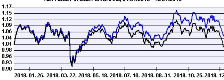
NET ASSET VALUE PER SHARE, 01/01/2018 - 12/31/2018

— Aegon Russia Equity Fund PLN series — Benchmark