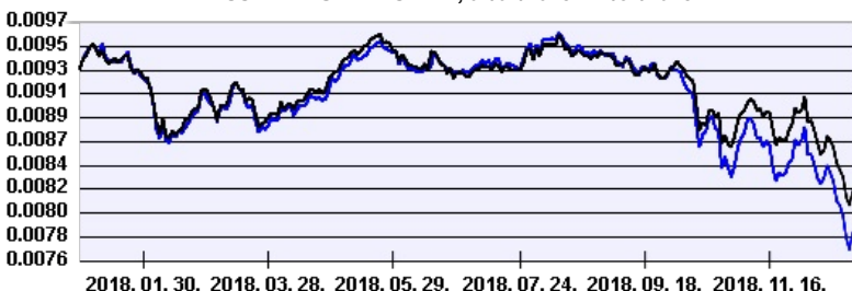
NET ASSET VALUE PER SHARE, 01/01/2018 - 12/31/2018

— Aegon MegaTrend Equity Fund of Funds EUR series — Benchmark