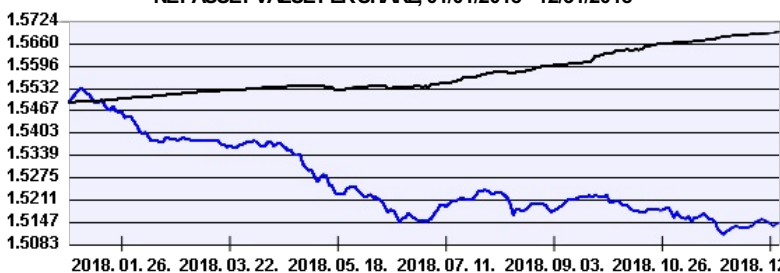
NET ASSET VALUE PER SHARE, 01/01/2018 - 12/31/2018

— Aegon BondMaxx Total Return Bond Investment Fund HUF series — Benchmark