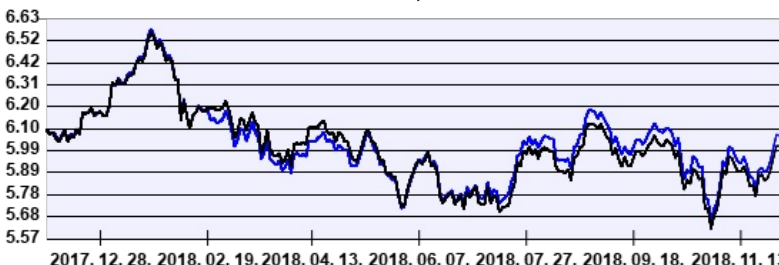
NET ASSET VALUE PER SHARE, 12/01/2017 - 11/30/2018

— Aegon Central European Equity Fund institutional series — Benchmark