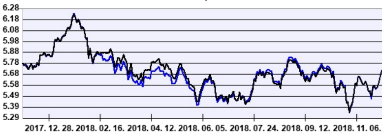
NET ASSET VALUE PER SHARE, 12/01/2017 - 11/30/2018

— Aegon Central European Equity Fund HUF series — Benchmark