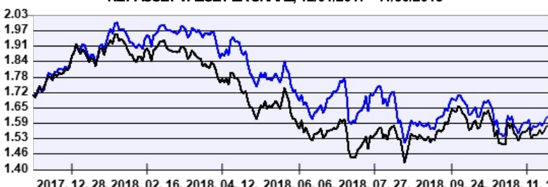
NET ASSET VALUE PER SHARE, 12/01/2017 - 11/30/2018

— Aegon Istanbul Equity Fund TRY series — Benchmark