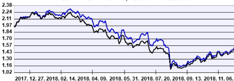
NET ASSET VALUE PER SHARE, 12/01/2017 - 11/30/2018

— Aegon Istanbul Equity Fund HUF series — Benchmark