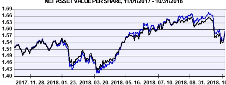
NET ASSET VALUE PER SHARE, 11/01/2017 - 10/31/2018

— Aegon International Equity Fund institutional series — Benchmark