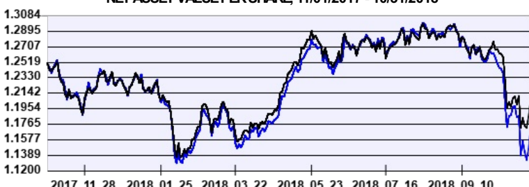
NET ASSET VALUE PER SHARE, 11/01/2017 - 10/31/2018

— Aegon MegaTrend Equity Fund of Funds HUF series — Benchmark