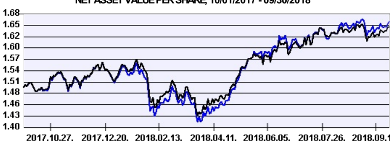
NET ASSET VALUE PER SHARE, 10/01/2017 - 09/30/2018

— Aegon International Equity Fund institutional series — Benchmark