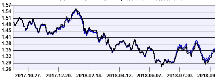
NET ASSET VALUE PER SHARE, 10/01/2017 - 09/30/2018

— Aegon Polish Equity Fund institutional series — Benchmark