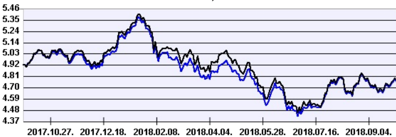
NET ASSET VALUE PER SHARE, 10/01/2017 - 09/30/2018

— Aegon Central European Equity Fund EUR series — Benchmark