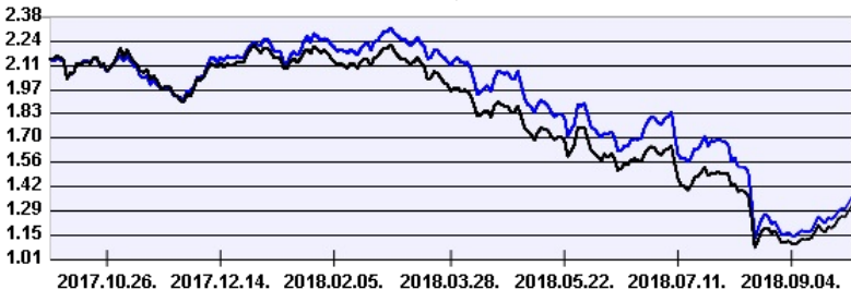
NET ASSET VALUE PER SHARE, 10/01/2017 - 09/30/2018

— Aegon Istanbul Equity Fund HUF series — Benchmark