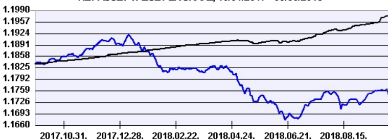
NET ASSET VALUE PER SHARE, 10/01/2017 - 09/30/2018

— Aegon BondMaxx Total Return Bond Investment Fund R series — Benchmark Past performance is no guarantee of future results. This report should not be considered as an offer or investment advisory. The Fund Prospectus contains the detailed conditions of the investment. The distribution costs of the fund purchase can be found at the distributors.