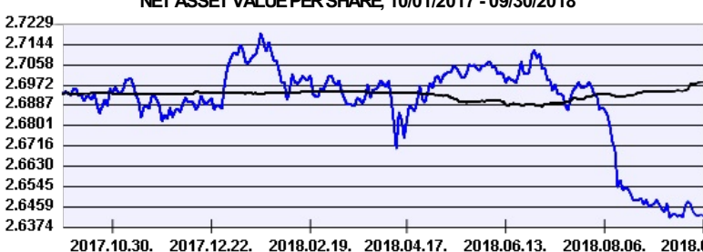
NET ASSET VALUE PER SHARE, 10/01/2017 - 09/30/2018

— Aegon Alfa Total Return Investment Fund HUF series — Benchmark Past performance is no guarantee of future results. This report should not be considered as an offer or investment advisory. The Fund Prospectus contains the detailed conditions of the investment. The distribution costs of the fund purchase can be found at the distributors.