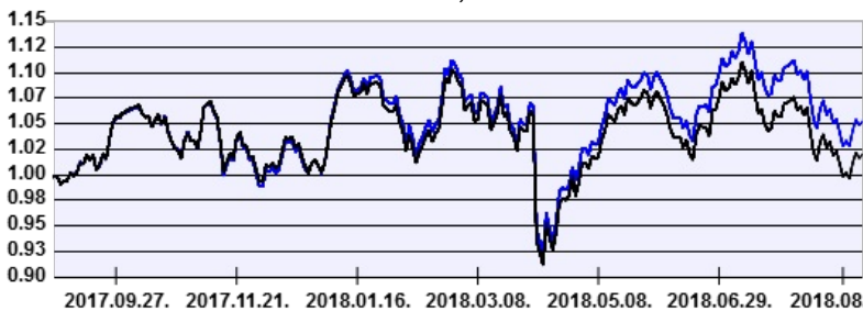
NET ASSET VALUE PER SHARE, 09/01/2017 - 08/31/2018

— Aegon Russia Equity Fund PLN series — Benchmark