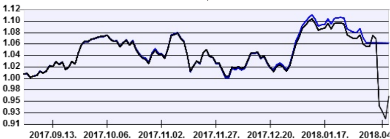
NET ASSET VALUE PER SHARE, 09/01/2017 - 08/31/2018

— Aegon Russia Equity Fund PI series — Benchmark