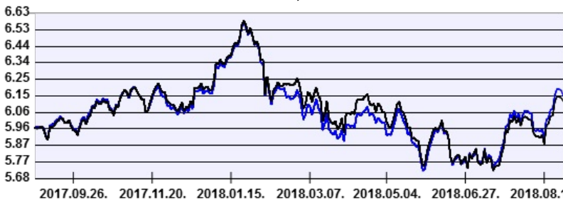
NET ASSET VALUE PER SHARE, 09/01/2017 - 08/31/2018

— Aegon Central European Equity Fund institutional series — Benchmark