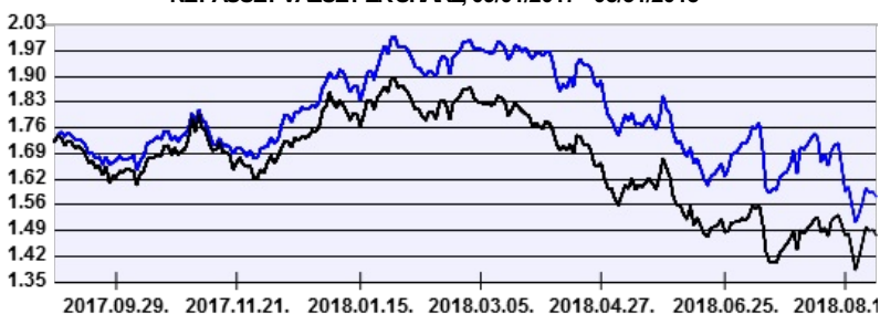
NET ASSET VALUE PER SHARE, 09/01/2017 - 08/31/2018

— Aegon Istanbul Equity Fund TRY series — Benchmark