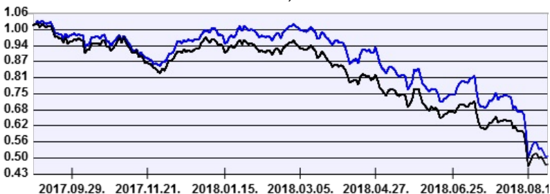
NET ASSET VALUE PER SHARE, 09/01/2017 - 08/31/2018

— Aegon Istanbul Equity Fund PLN series — Benchmark