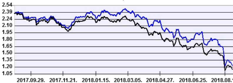
NET ASSET VALUE PER SHARE, 09/01/2017 - 08/31/2018

— Aegon Istanbul Equity Fund institutional series — Benchmark