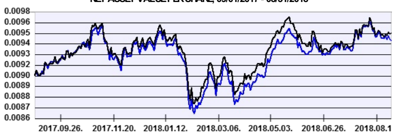
NET ASSET VALUE PER SHARE, 09/01/2017 - 08/31/2018