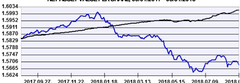
NET ASSET VALUE PER SHARE, 09/01/2017 - 08/31/2018

— Aegon BondMaxx Total Return Bond Investment Fund institutional series ---- Benchmark