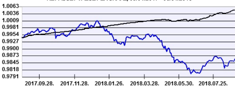
NET ASSET VALUE PER SHARE, 09/01/2017 - 08/31/2018

— Aegon BondMaxx Total Return Bond Investment Fund CZK series — Benchmark Past performance is no guarantee of future results. This report should not be considered as an offer or investment advisory. The Fund Prospectus contains the detailed conditions of the investment. The distribution costs of the fund purchase can be found at the distributors.