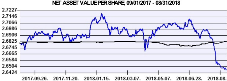
NET ASSET VALUE PER SHARE, 09/01/2017 - 08/31/2018

--- Aegon Alfa Total Return Investment Fund HUF series --- Benchmark