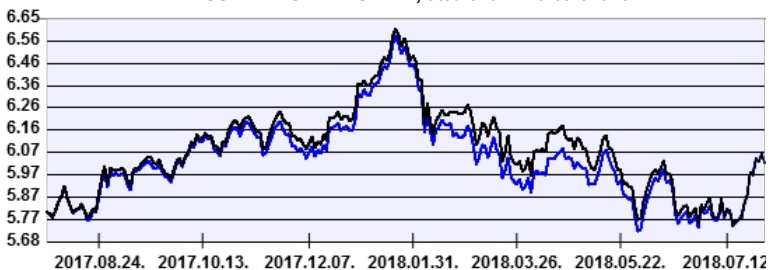
NET ASSET VALUE PER SHARE, 08/01/2017 - 07/31/2018

— Aegon Central European Equity Fund institutional series — Benchmark