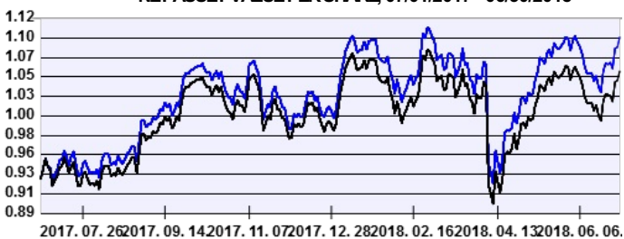
NET ASSET VALUE PER SHARE, 07/01/2017 - 06/30/2018

— Aegon Russia Equity Fund PLN series — Benchmark