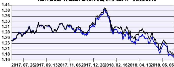
NET ASSET VALUE PER SHARE, 07/01/2017 - 06/30/2018

— Aegon Central European Equity Fund CZK series — Benchmark