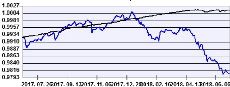
NET ASSET VALUE PER SHARE, 07/01/2017 - 06/30/2018

— Aegon BondMaxx Total Return Bond Investment Fund CZK series — Benchmark