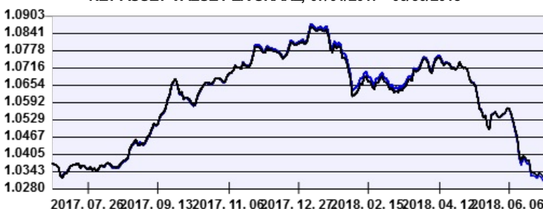
NET ASSET VALUE PER SHARE, 07/01/2017 - 06/30/2018

— Aegon Domestic Bond Fund institutional series — Benchmark