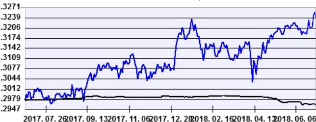
NET ASSET VALUE PER SHARE, 07/01/2017 - 06/30/2018

----- Aegon Alfa Total Return Investment Fund Rseries ----- Benchmark