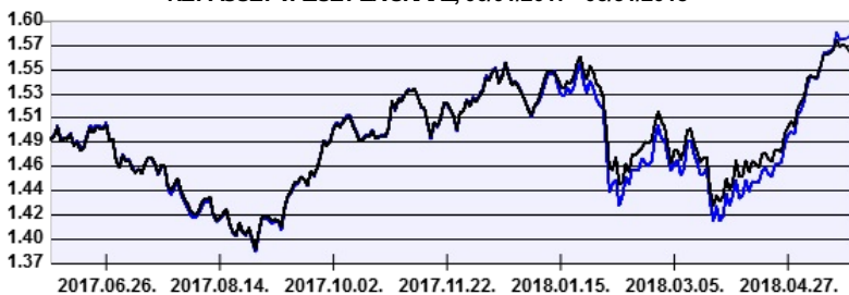
NET ASSET VALUE PER SHARE, 06/01/2017 - 05/31/2018

— Aegon International Equity Fund institutional series — Benchmark