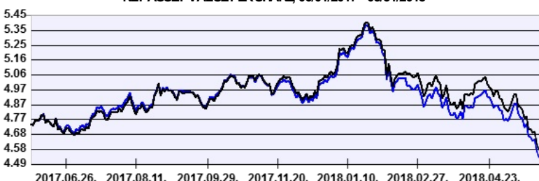
NET ASSET VALUE PER SHARE, 06/01/2017 - 05/31/2018

----- Aegon Central European Equity Fund EUR series ----- Benchmark