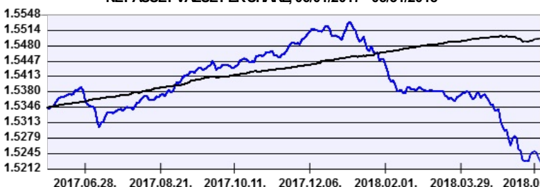
NET ASSET VALUE PER SHARE, 06/01/2017 - 05/31/2018

— Aegon BondMaxx Total Return Bond Investment Fund HUF series — Benchmark Past performance is no guarantee of future results. This report should not be considered as an offer or investment advisory. The Fund Prospectus contains the detailed conditions of the investment. The distribution costs of the fund purchase can be found at the distributors.