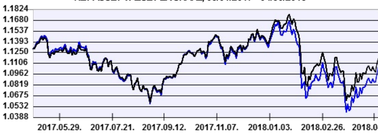
NET ASSET VALUE PER SHARE, 05/01/2017 - 04/30/2018

— Aegon International Equity Fund EUR series — Benchmark