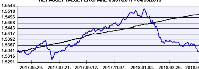
NET ASSET VALUE PER SHARE, 05/01/2017 - 04/30/2018

— Aegon BondMaxx Total Return Bond Investment Fund HUF series — Benchmark