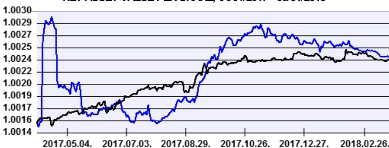
NET ASSET VALUE PER SHARE, 04/01/2017 - 03/31/2018

— Aegon Money Market Fund institutional series — Benchmark