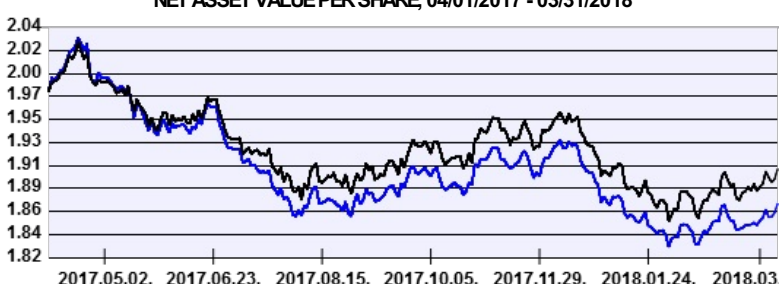
NET ASSET VALUE PER SHARE, 04/01/2017 - 03/31/2018

— Aegon International Bond Fund — Benchmark