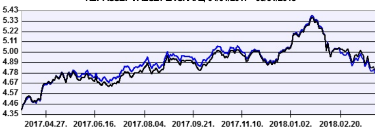
NET ASSET VALUE PER SHARE, 04/01/2017 - 03/31/2018

----- Aegon Central European Equity Fund EUR series ----- Benchmark