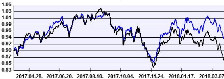
NET ASSET VALUE PER SHARE, 04/01/2017 - 03/31/2018

--- Aegon Istanbul Equity Fund PLN series --- Benchmark