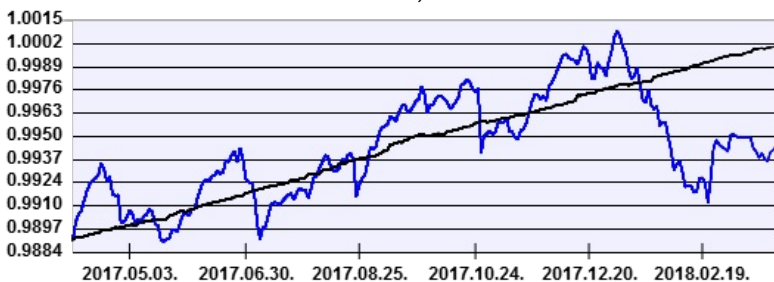
NET ASSET VALUE PER SHARE, 04/01/2017 - 03/31/2018

— Aegon BondMaxx Total Return Bond Investment Fund CZK series — Benchmark Past performance is no guarantee of future results. This report should not be considered as an offer or investment advisory. The Fund Prospectus contains the detailed conditions of the investment. The distribution costs of the fund purchase can be found at the distributors.