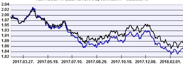
NET ASSET VALUE PER SHARE, 03/01/2017 - 02/28/2018

— Aegon International Bond Fund — Benchmark