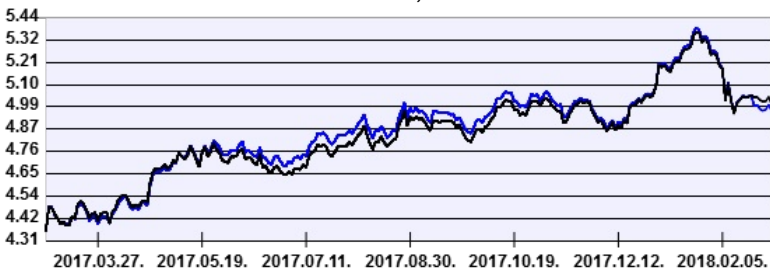
NET ASSET VALUE PER SHARE, 03/01/2017 - 02/28/2018

— Aegon Central European Equity Fund EUR series — Benchmark